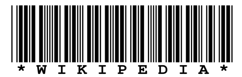
Figure 1: Example of a 3 of 9 bar code for Alpha Numeric Strings