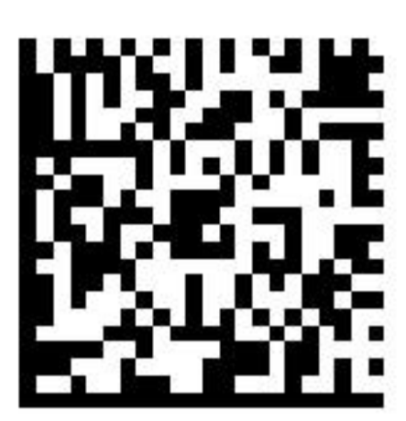
Figure 3: DataMatrix code representing ZI6ROVmkR5xqSQW5wOeUZQ==